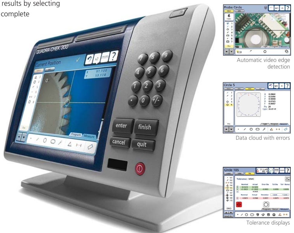
Automatic video edge detection

QC-300 accommodates multiple languages, including English, French, German and Italian.