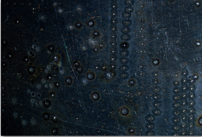
Fig. 1: Sample image - steel plate