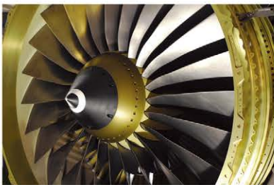
Turbine Blade Inspection